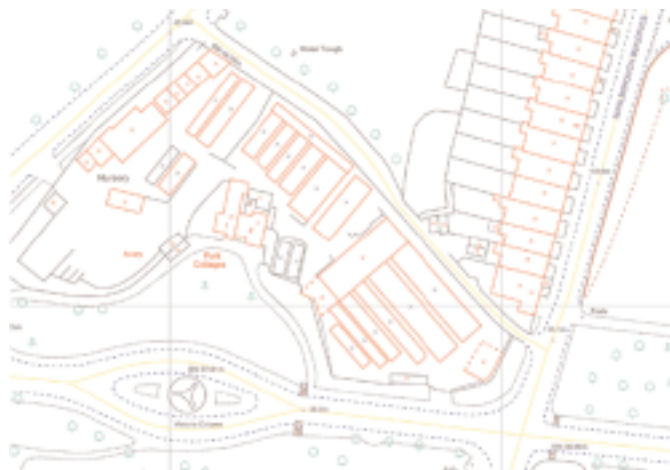
Figure 1. Though rich in detail and meaningful to the human eye, OS Land-Line data lack attribution enabling automated feature classification.

Before exploring the challenges of managing an extremely detailed digital countrywide dataset, consider what sets MasterMap apart from most other spa-