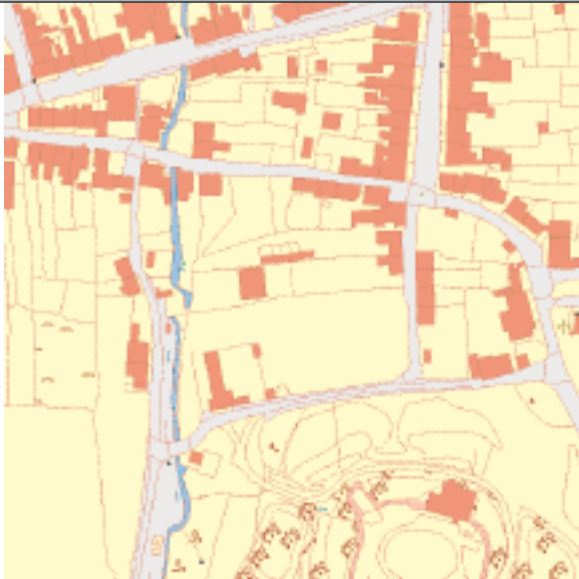
Figure 2. OS boasts that MasterMap building footprints even include the bulges of bay windows. Surveyors capture linework with centimeter-accurate GPS-enabled instruments.