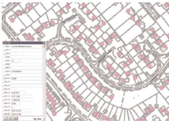
Figure 3. OS's ADDRESS-POINT dataset contains more than 26 million addresses, which are geocoded to their building structures and include a quality and accuracy rating.

tial datasets of its kind. Namely, MasterMap's data are fine-grained, comprehensive, and 100 percent complete across all of Great Britain. Comprehensive in this context means that OS captures most permanent, real-world objects in its surveys. For instance, MasterMap includes the following themes: administrative boundaries, buildings, heritage and antiquities, land, rail, roads, tracks and paths, structures, terrain and height, and water (see Figure 2).